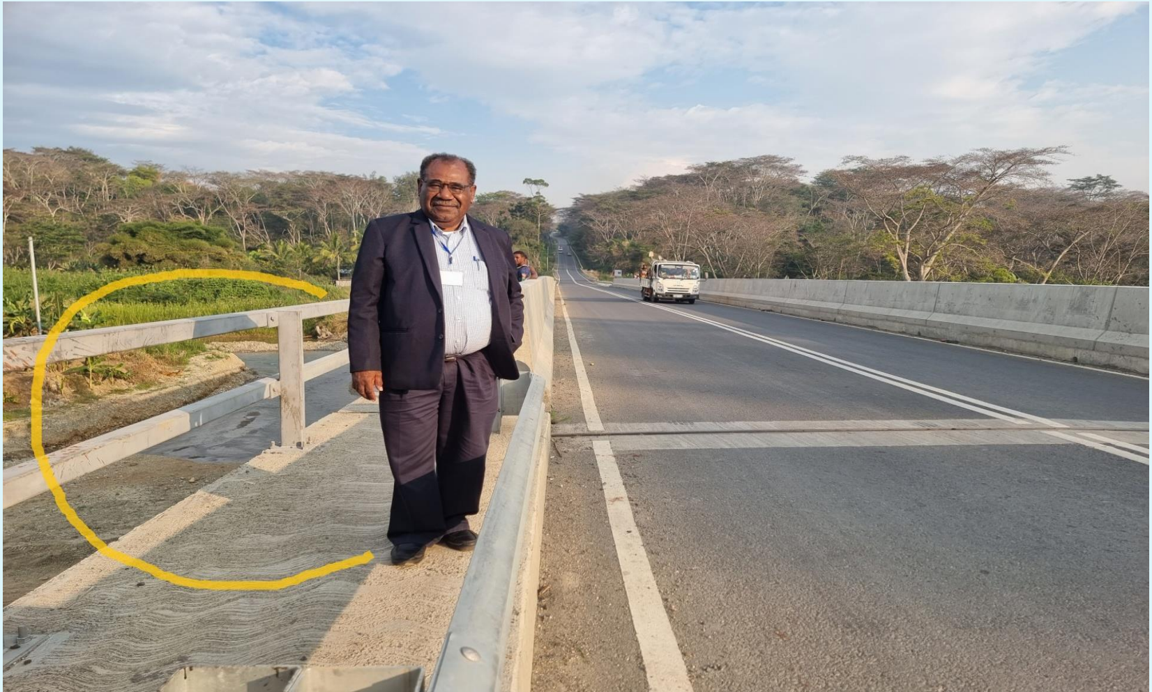
Benabena Bridge – Goroka (August 2025)